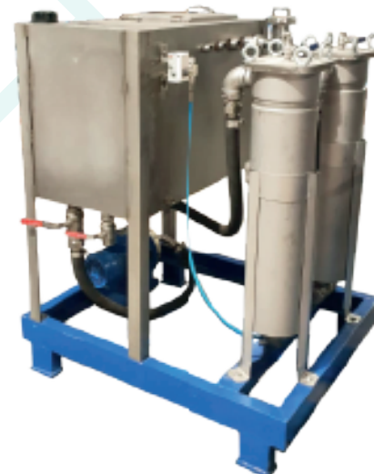
Filtering system HPTANK-300-2-54x